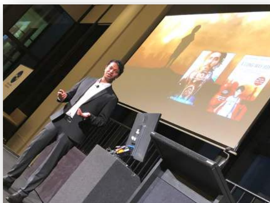
Left: Guest speaker Saroo Brierly moved guests with his inspiring life story

A special thanks to Trility for sponsoring the conference and Davidson Executive & Boards for sponsoring the Conference Dinner. We very much appreciate the ongoing and loyal support of both organisations.