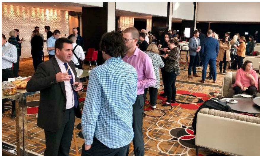
Above: SIG delegates networking during break time

Special thanks to our event sponsors Yarra Valley Water and SUEZ, industry supporters AWA Vic Branch and VicWater as well as our enthusiastic delegates for the valuable knowledge sharing and positive learnings that we all take back to our businesses.