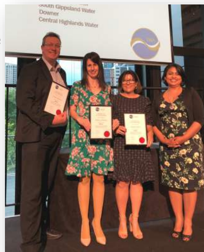
Above: Presentation of IWA new members at the November 2018 Conference Dinner