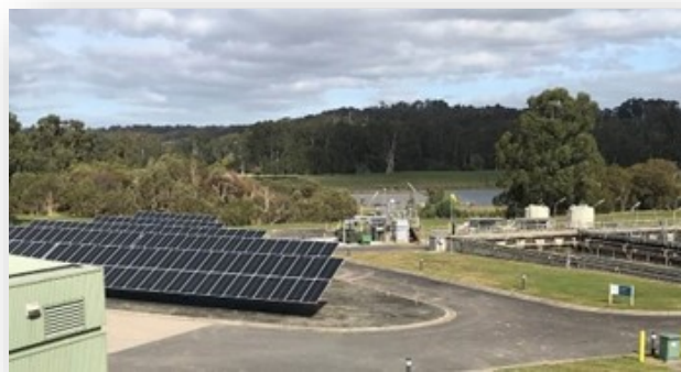
Picture above: February 2019 Tour to the Yarra Valley Water Upper Yarra Treatment Plant

Capital Delivery Project Manager East Gippsland Water Energy and Greenhouse Convenor