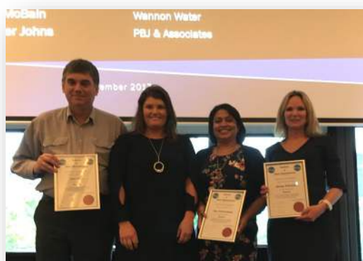
Presentation of IWA Membership upgrades November 2017 Conference Dinner

A special thanks to Trility for sponsoring the conference and Davidson Executive & Boards for sponsoring the Conference Dinner. We very much appreciate the ongoing and loyal support of both organisations.