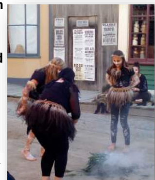
Wathaurung Women perform a smoking ceremony at Sovereign Hill prior to the Conference Dinner in Ballarat.

A special thanks to Veolia for sponsoring the conference and Central Highlands Water for sponsoring the Conference Dinner.