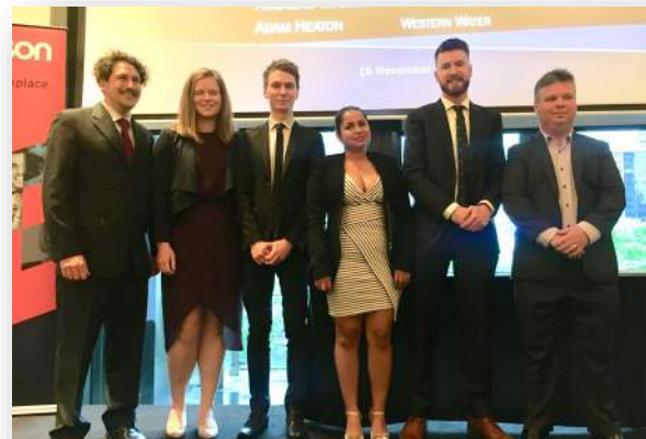
Pictured below: 2018 Laurie Gleeson Award finalists