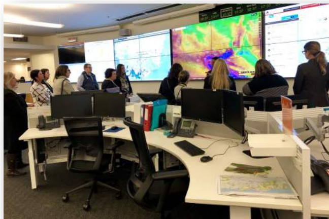
SIG tour of the DELWP State Emergency Control Centre, Melbourne

Corporate Governance SIG Convenor Manager Governance and Risk Central Highlands Water