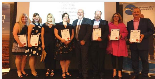
Presentation of new IWA Members: November 2015 Conference Dinner